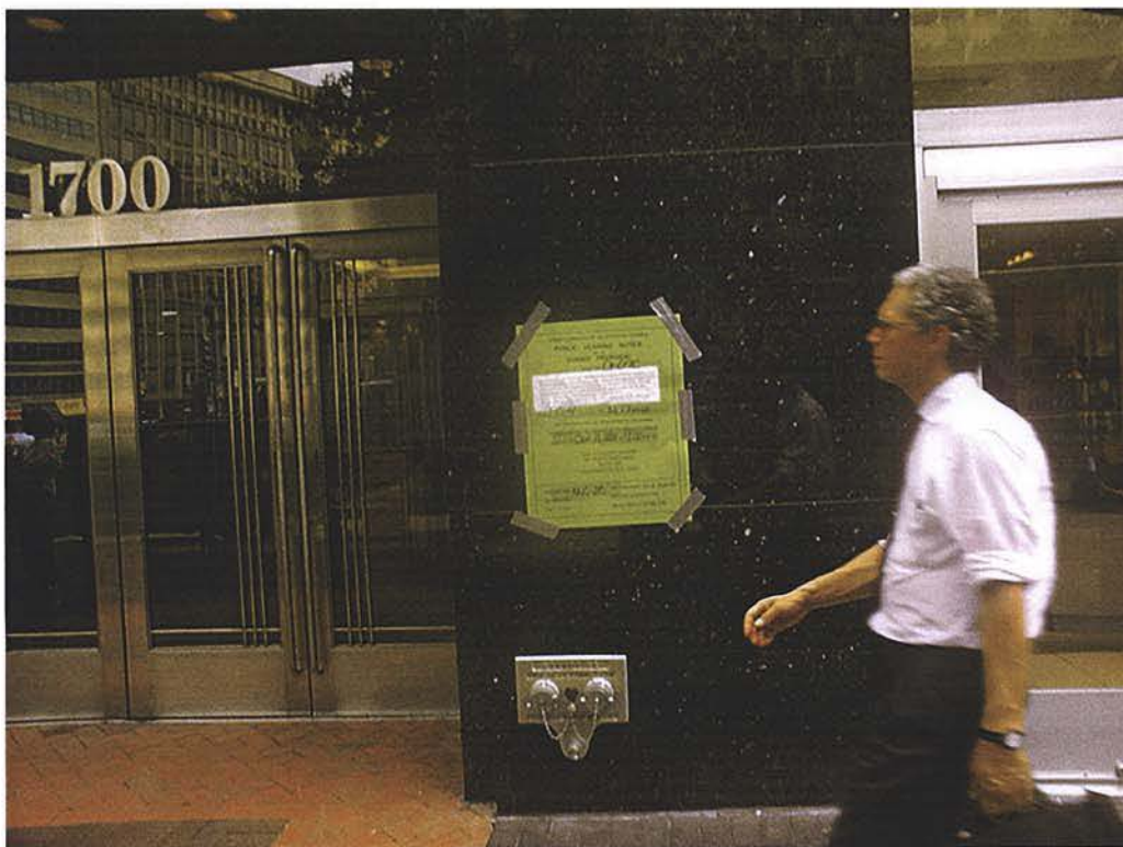
1700 K Street, N.W.