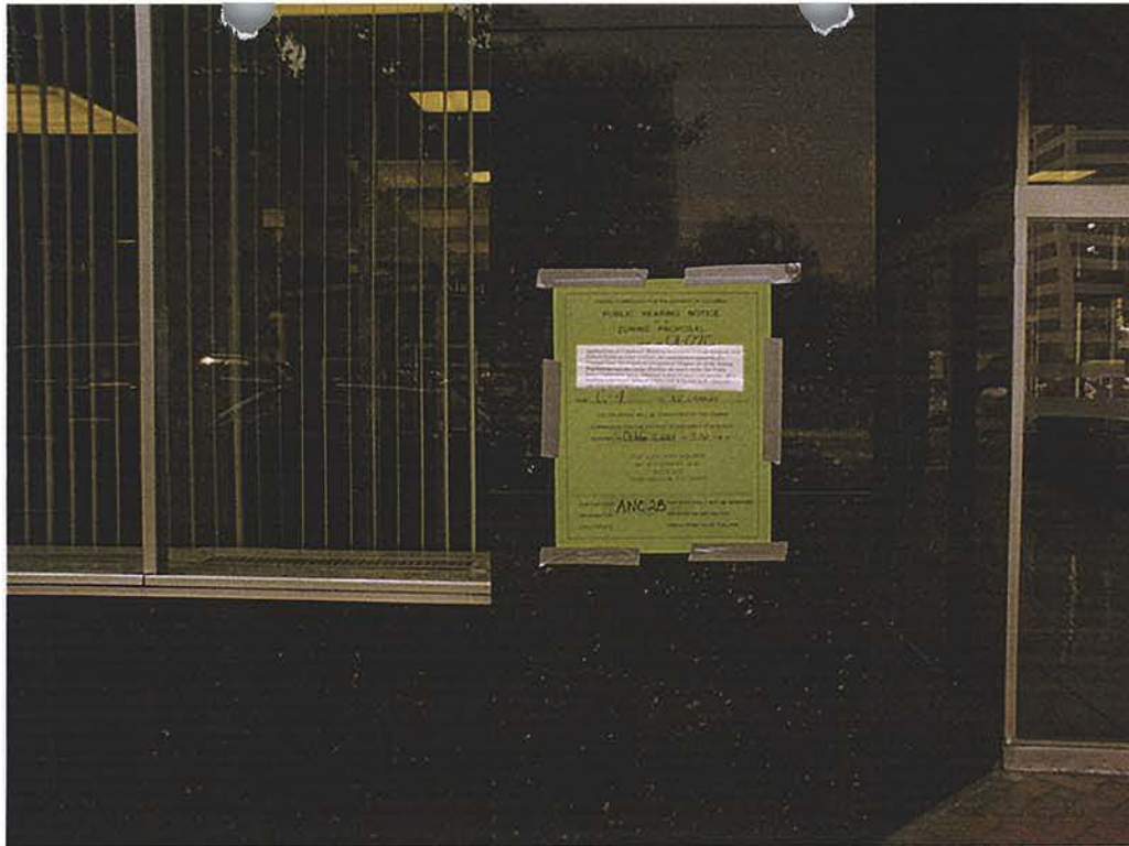
17 th Street, N.W.